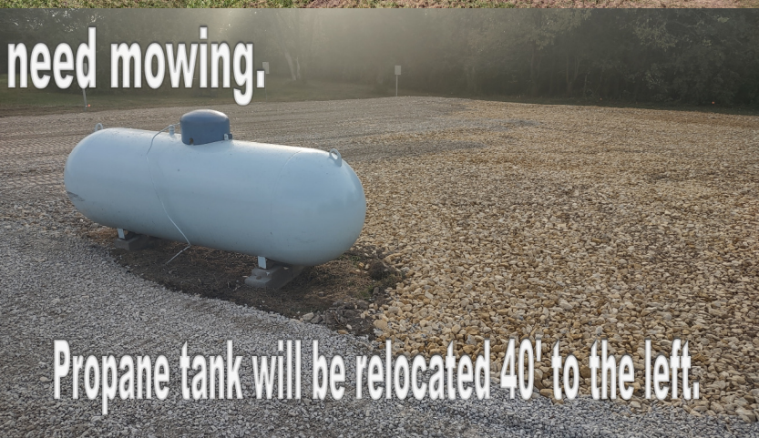
Propane tank will be relocated 40' to the left.