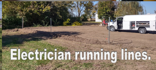
Electrician running lines.