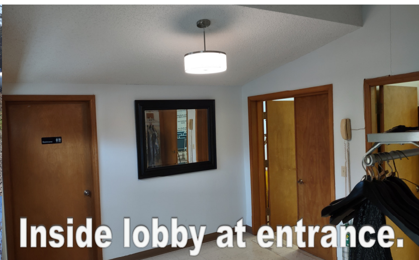
Inside lobby at entrance.