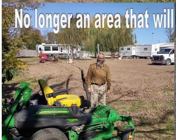
No longer an area that will need mowing.