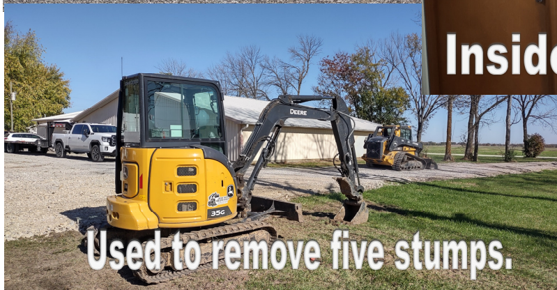
Used to remove five stumps.